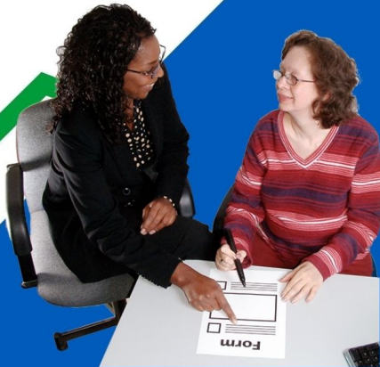
Filling the Form