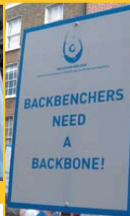
Pictures from national protest march in July 2010, organised by Inclusion Ireland.